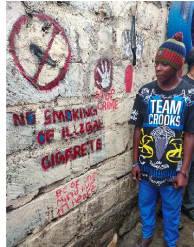
A young man in Kenya proudly shows off 'policy documents' painted by his group of street youth where they sleep. New policies (rules groups make for themselves) are outcomes.

Sustainable change is built by people and their self-driven, self-determined and on-going actions and interactions. This means for people's lives to improve, a diversity of people should be involved in processes to make things better. People need to have ideas and visions for what better can look like. Most importantly, they need to have access to power, knowledge and resources to participate in the actions that affect them and the systems in which they live and work. This is the basis for many participatory, empowerment 3 and gender-transformative 4 approaches, in which Outcome Mapping is firmly rooted.