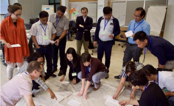
Participants identifying Boundary Partners at the OM Learning & Exchange, Bangkok, 2018

Sphere of influence has become a commonplace term. 20 years ago, this concept denoted a shift away from conventional planning, monitoring and evaluation approaches, which were largely linear, and reductionist in terms of understanding cause-and-effect. Outcome Mapping shifted the conversation and the mindset from attribution and accountability for downstream impacts, to focusing on learning through social change efforts and shared contributions to outcomes (observable actor-centred behavioural changes). Attributing change to your programmes' influence alone is often unrealistic. Simply asking "did what we want, happen?" restricts learning from on-going change and prevents deeper understanding of system dynamics, interactions, and perspectives.