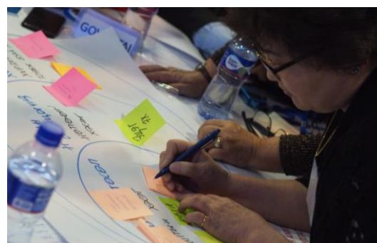
Mapping actors OM-style at the start of an OH evaluation to bring clarity on whose behaviour changes matter

A transformative and complex adaptive system view requires that change makers combine and privilege different ways of seeing and knowing the challenges. They need to use multiple strategies and methods at many levels that are grounded in the context and purposes. A common example is to use Outcome Harvesting and Outcome Mapping together as they share core concepts. Outcome Harvesting can be used before Outcome Mapping to show how system actors are already changing,