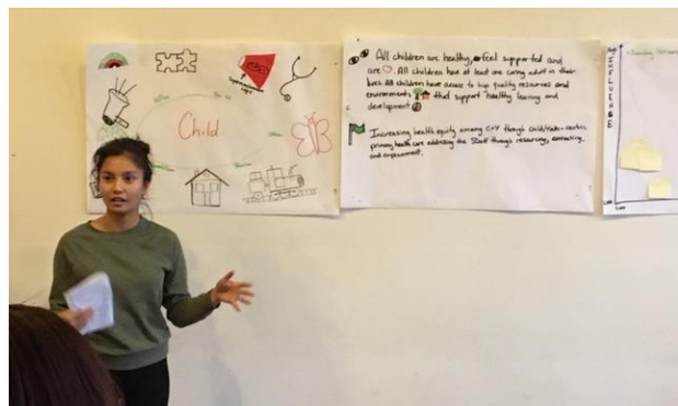
Using OM to develop a child-centred vision for a families organisation in Ottawa, Canada, 2017

Outcome Mapping as a framework for planning collaborative interventions for transformative change requires us to embrace uncertainty and a complex adaptive systems (CAS) view of our world. While engineers can confidently predict the response of titanium to mechanical stress, change makers cannot calculate how people will engage with social and environmental stress. When change makers work from a CAS view, they are less likely to rely on technical solutions to complex challenges. Instead, change makers' creatively embrace adaptive and collaborative ways of working that value continuous experimentation and see the whole as greater than the sum of its parts.